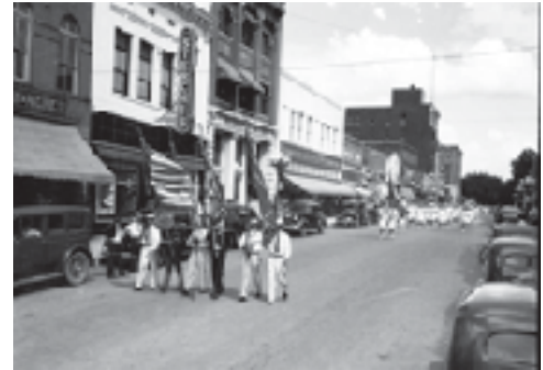
Main and Trade St., late 1930s by Ward

The archives has Ward's photograph collection of approximately 1300 pieces from the 1930s, 40s, 50s, and 60s.